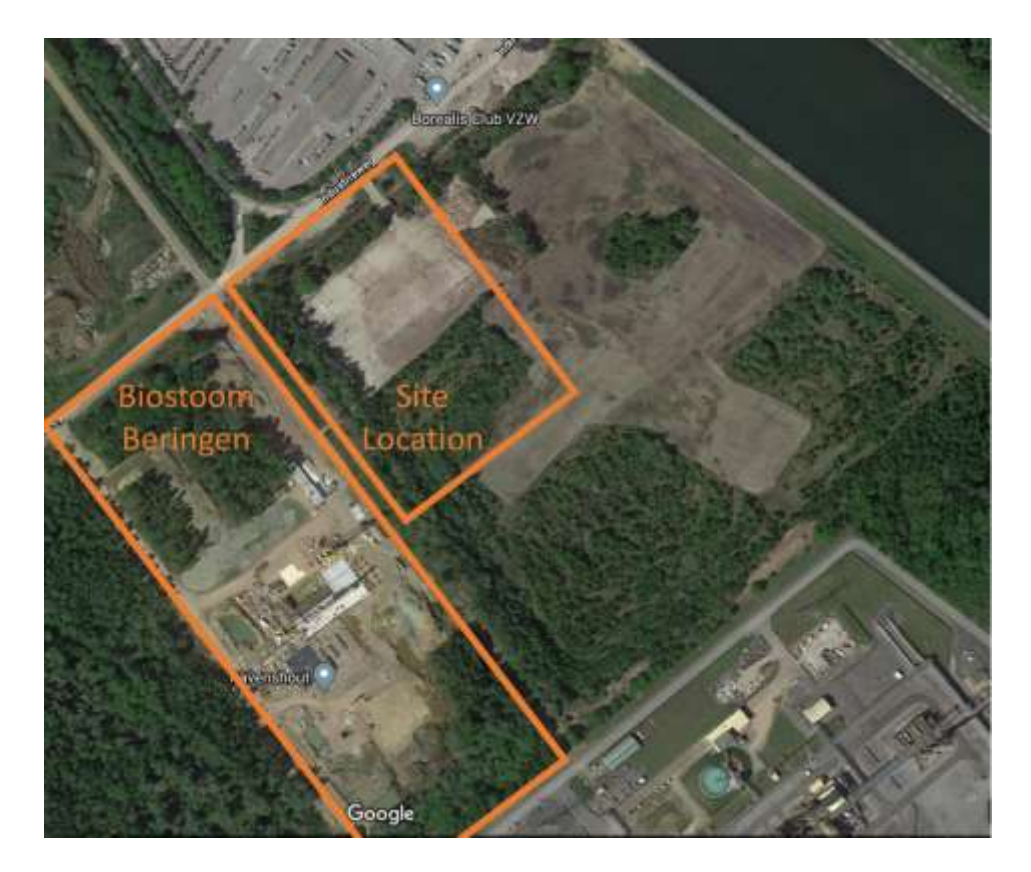
Figure 1: Site location

For its Optimo project Limburg.net aims to collect 5 different waste fractions in one and the same garbage truck. The waste collection bags have a certain colour for a certain waste fraction. Once collected house-by-house, the garbage truck transports the mix of waste collection bags to the new sorting plant where the bags are sorted by colour (or alternative). The new Optimo sorting plant will be located in Ravenshout – Beringen, next to the newly build biosteam plant of Biostoom Beringen (an affiliate of Bionerga).